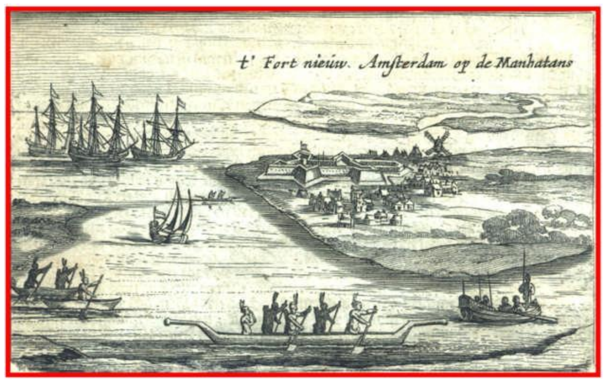
New York City was founded by a deliberate decision of the New Netherland governing council which—seated [in a fort] on Governors Island—selected Manhattan Island in the year 1625 as the principal place for permanent settlement by starting construction of Fort Amsterdam as New Netherland's capitol and the adjacent village of New Amsterdam as the province's capital.