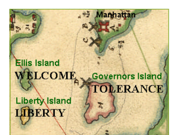
National Heritage Triangle

Looking forward to hearing from you, I am.