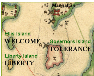
National Heritage Triangle

Will you give us your endorsement for this quintessentially American precept?